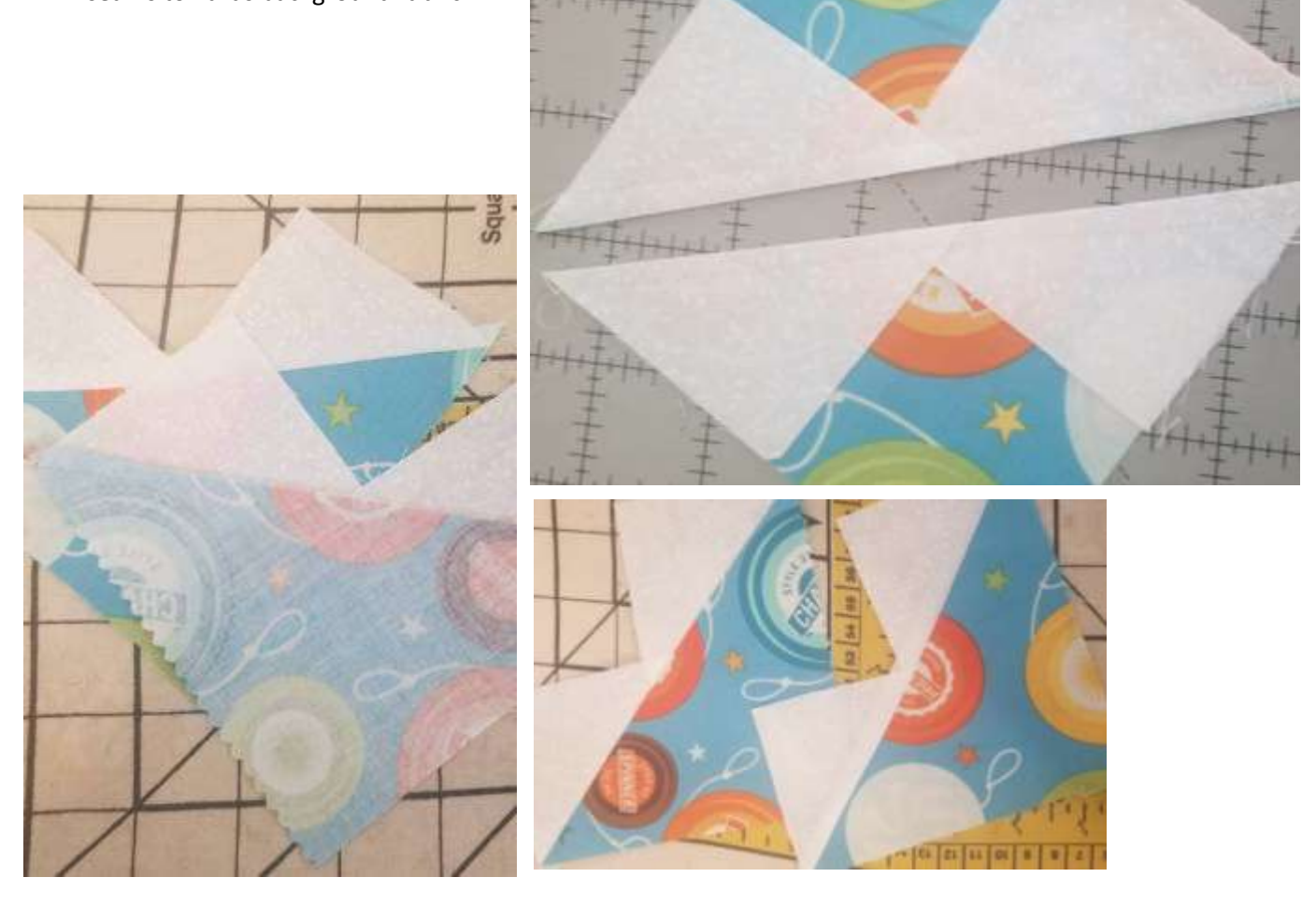
Step 4. Back at the machine with the two unused small background squares, position and sew on each side of the line.